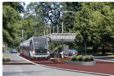
High Quality Bus Halts (example from Eugene, Colorado)

The Green Line route linking both universities, city centre, rail station and four of the 'six towns' has been adopted as the preferred route for Phase 1. This would require 14 vehicles to operate a 10 minute frequency service.