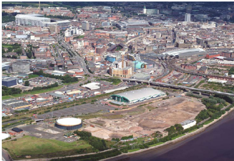
Forth Yards Area

Options for all modes were refined in conjunction with the city authorities and a preferred strategy masterplan has now been agreed and is being used by the council for planning purposes.