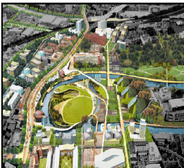
Concept for the Crescent Boulevard

adopted, rather a detailed junction appraisal has been undertaken to increase efficiency of the network whilst improving pedestrian and cycle facilities. Banning of certain lightly used turning movements being found to provide significant capacity increases on strategic routes whilst generating minimal adverse impact on local roads.